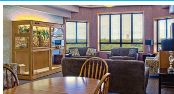
Aviary in West Lounge provided through M-Club donations.

tenants. Donors may give contributions in honor of a living person, a special event, or in memory of someone.