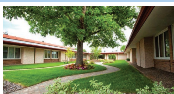
Courtyard renovation provided through the generosity of the M-Club.

Please visit our website at www.mslcc.com for more information on our foundation and our facility.